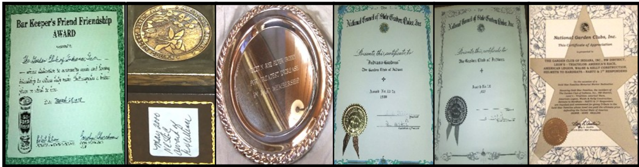
If you know, Let us know!

Over the years, TGCI, Inc. has received 10 awards in Land Trust and contributed over $100,000