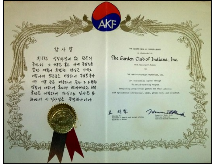
This award from South Korea for world gardening that TGCI received (1 of only 7 states) at National Convention in 1972.