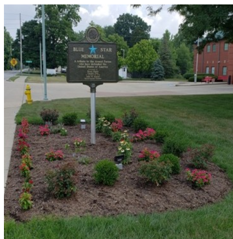
Broadripple Garden Club's Blue Star Memorial