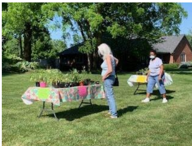
June 6th Plant Sale fundraiser for Sages Garden Club.