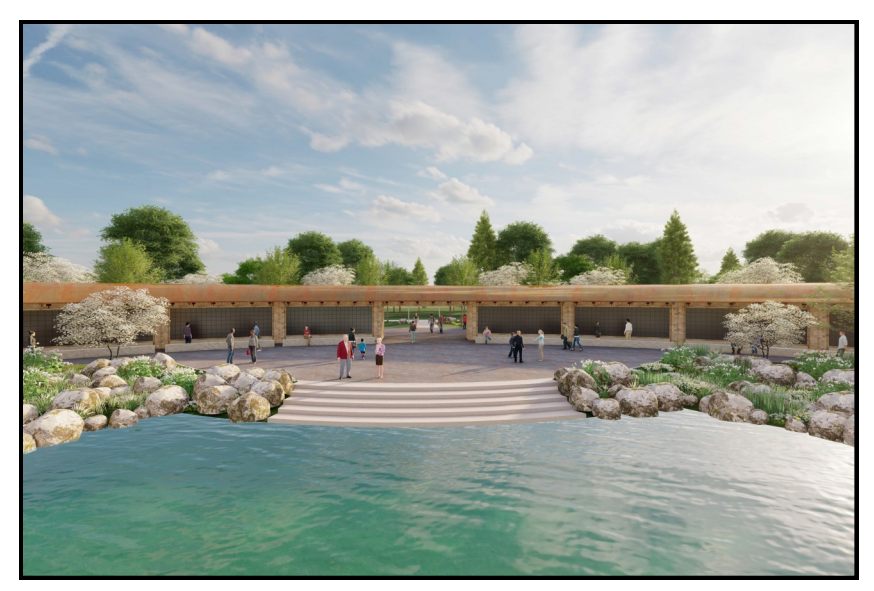
The future Memorial Garden.

Four Winds Garden Club inspired the idea of a memorial garden at the very conception of the Wellfield Botanical Garden. Since 2011 with donations from area and district garden clubs, we have donated almost $18,000 dollars. Elkhart Community Foundation Fund has also made donations toward the Memorial Garden. Garden Clubs have been instrumental in the creation of the Memorial Garden at Wellfield Botanical Gardens. We should all be proud of this accomplishment.