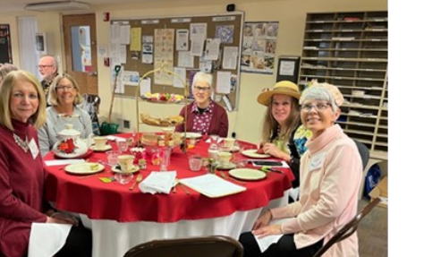
Everyone is enjoying all of the goodies that were presented. The mail boxes are simply adorable. Fun times.