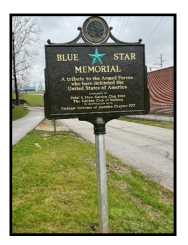
Petal and Stem Garden Club Blue Star Memorial Dedicated on May 30, 2022.

The Garden Club of Indiana, Inc. is looking forward to a dedication this year in Monticello, IN. A Blue Star By-Way Marker dedication on Veterans Day at Altherr Park in Monticello, IN, is planned by the Monticello Garden Club.