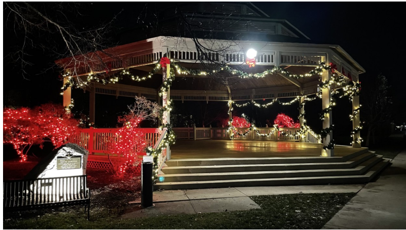
Christmas time at the gazebo.