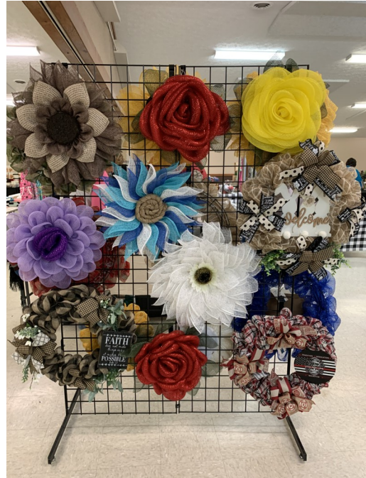
Another new vendor.