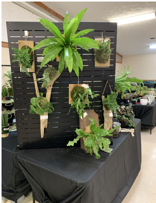
The Plant Van, just one of the new vendors.

August of 2014, eighteen members of Arts & Flowers sat around my dining table to discuss a Saturday event for the community. My first thought was, select a couple speakers and offer an educational workshop. One member looked at me and said, "Do we ALWAYS have to learn something?" "Can we just offer a fun day to thank the community for their support?" And just like that, "Through the Garden Gate" garden expo was born.