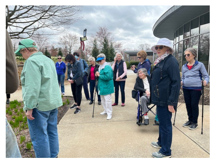
Members of the Fall Creek Garden Club enjoyed a tour of Newfields in early April.